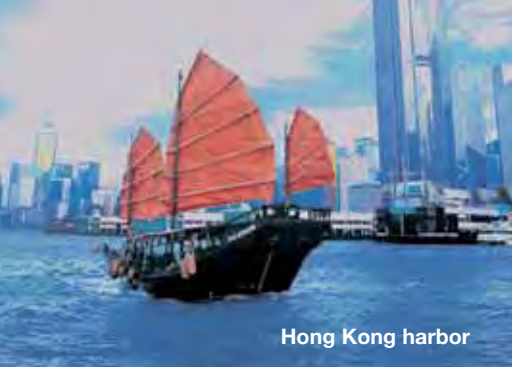
Hong Kong harbor