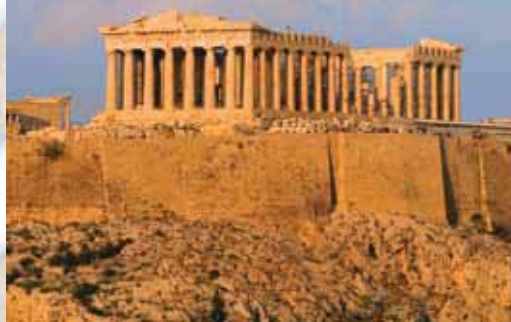
The Parthenon Athens, Greece