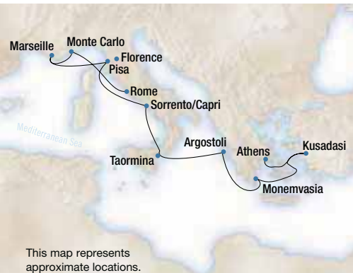
This map represents approximate locations.

Oceania Cruises may modify the cruise itinerary up to and during the voyage.