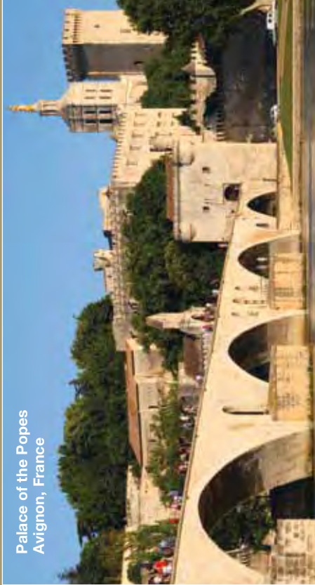
Palace of the Popes Avignon, France

bon appetit culinary center Aboard Riviera